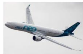
International IFR flights

This definition includes all types of aircraft without a pilot on board, including radio-controlled flying models (powered fixed wing, helicopters, gliders) whether they have an on-board camera or not.