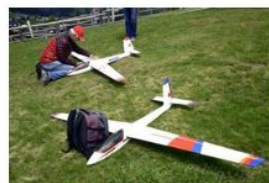
Leisure flights, including with model aircraft