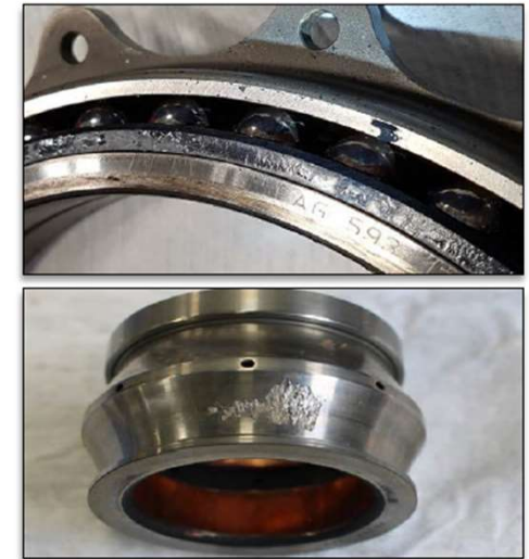
Figure 2 : Metal indentations as well as heavy spalling and pitting found on bearing races

Teardown analysis revealed the source of metal generation was from a planetary bearing. Collateral damage led to replacement of parts throughout main gearbox.