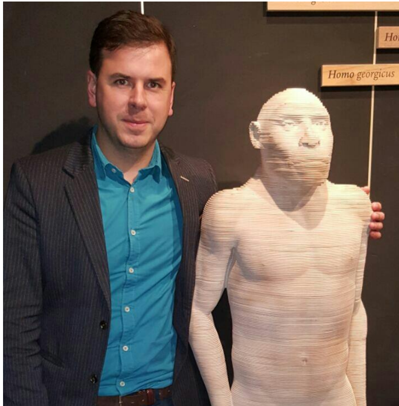
Appeared 1.8 mln years ago