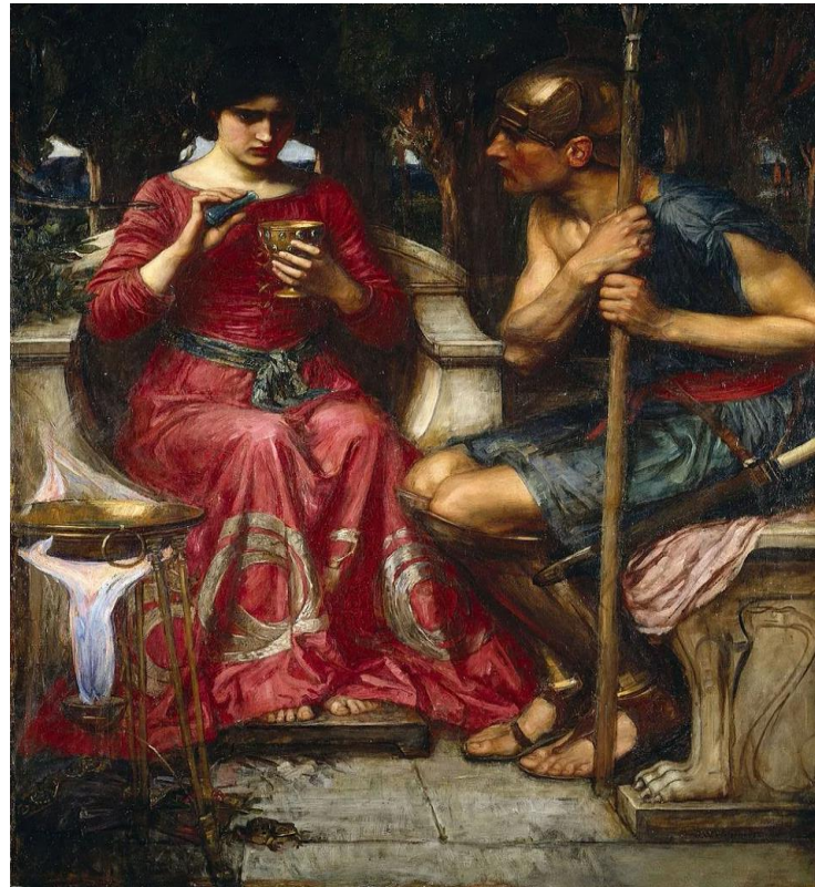
Medea and golden fleece