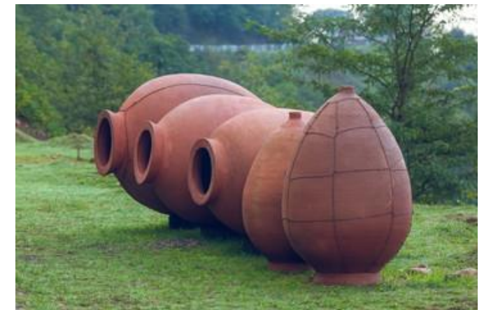
Homeland of wine Producing wine for 8K years