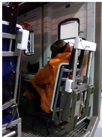
Figure 2 - Energy absorbing seat for training in a stroked position