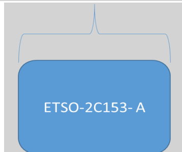
Shared resources of the F-ETSO equipment

...then the applicant shall describe the use of the original ETSO-2C153 platform with regard to the ETSO-2C153 Appendix 3 data (such as the user guide) and describe the remaining resources with respect to that Appendix 3 data so that it is clear which shared resources remain available for future incremental development by an independent user or aircraft manufacturer. In particular, the resources that are used and allocated shall be described and quantified.