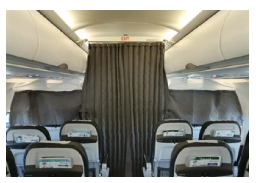
If you install cabin signs, you need to be aware of the existence of this Equivalent Safety Finding (ESF).